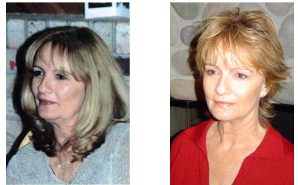
Before Aloette Nov. 2002

This is a customer who was burning trash and an aerosol can exploded in her face. She was allergic to the burn crème that the hospital gave her, so instead only used her AloePure skincare. Check her out just two months later!! How awesome is that!! If Aloette can do that for such severely damaged skin, imagine what it can do for YOUR skin!!!